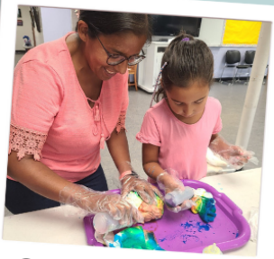
Tie Dye Workshop

2023 was an exciting year for the Town of Esopus Library! While I only joined the library team in June, it was a bustling six months of library programs, outreach events, and increased library services. Adult programs focused on health and wellness with chair yoga, Tai Chi, Zumba, slow flow mat yoga, and meditation. Medicare 101 and presentations with the Hudson Valley chapter of the Alzheimer's Association provided up-to-date information and tips for future planning. World and local history lectures featured WW1 and WW2 as well as local points of interest like the Gomez Mill House in Marlboro. The Mid-Hudson Astronomical Association had us looking up at the night sky for an evening of stargazing with three different telescopes. A variety of local authors also visited to discuss their latest works of both fiction and non-fiction. Teen programs took off with a variety of hands-on opportunities to get creative in our Make One Take One, Nailed It, and Bad Art workshops. Teens also had an opportunity to earn community service hours while volunteering at the library. The library ventured out into the community at Esopus' town-wide events like Trunk or Treat and the Winter Wonderland Parade. Classes from Ulster BOCES and volunteers from the Ulster County Youth Bureau visited to learn more about the library. Finally, the Duck Pond Gallery continued to feature local artists and photographers each month. We can't wait to see what we can bring to the Esopus community in 2024!