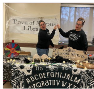
Town of Esopus Trunk or Treat