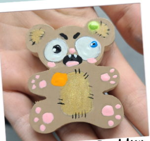
Five nights at Freddy's Workshop