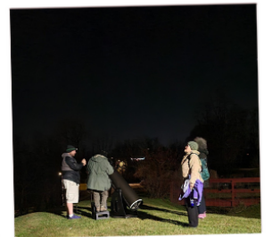
Stargazing with MHA