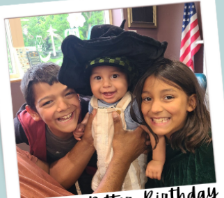
Harry Potter Birthday Celebration