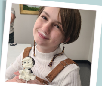
Nailed It Workshop