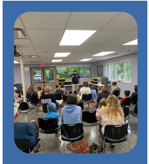
Summer Reading Kickoff with the Hudson Valley Reptile Rescue

2025 was my first full year in my role as Children's Programmer here at the Town of Esopus Library. . It has been wonderful to meet and get to know so many children and their families and to bring programming and reading into their lives on a daily basis. Some programming highlights have been increased storytimes including a new afternoon storytime, the ever creative Lego Club, and the Young Readers Book Club which is filled with kids who just love talking about books - a dream! The end of 2025 brought the opportunity to revamp and refresh the children's room. We took down some shelving and added new seating. The room is now more open, welcoming, and usable for a wide variety of programming - or just hanging out! All are welcome! I hope to see you at the library soon.